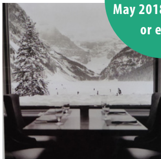
Judah Johnson, Looking Out, photo, Youthscape 2016