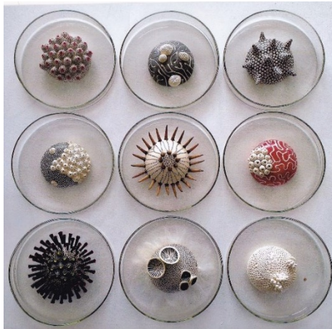
Miriam Dobson- Synthetic Organism ceramic winner 2018

Nature, the environment or climate change through landscapes, seascapes, fauna, flora, environmentally aware people &/or thought provoking images.